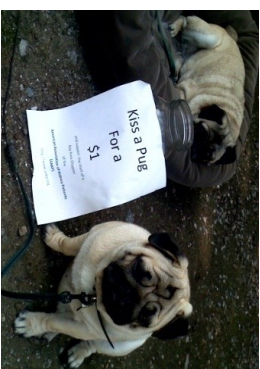
Patrick & Tomomi Barron's twin pugs raised money at the Garage Sale by selling $1.00 Kisses!

(We're looking for volunteers to help with the Spring Garage and Bake Sale!)